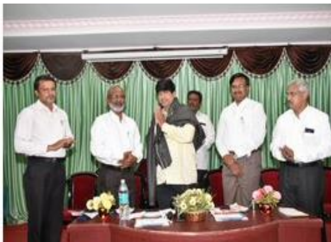
Three-day Sensitization Programme