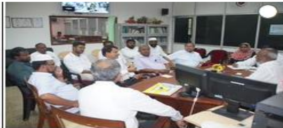
NAAC Accreditation: An Overview”

“NAAC Accreditation: An Overview” on 08.02.2019